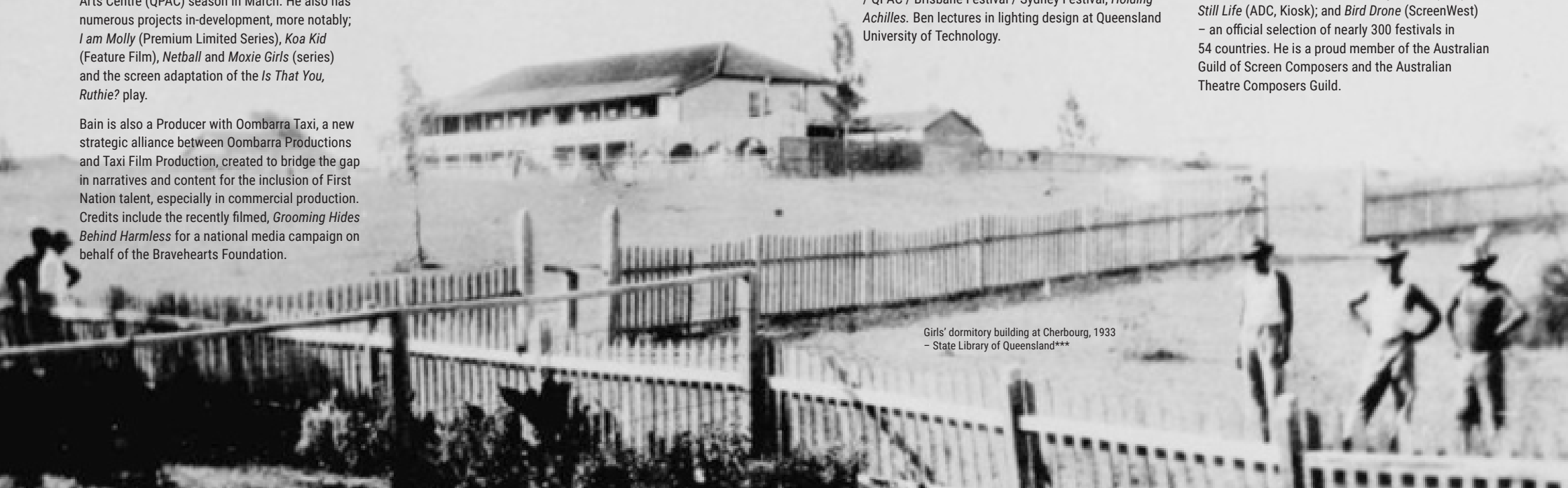
Girls' dormitory building at Cherbourg, 1933

Wil is also an internationally acclaimed composer for film, television and other media, being the recipient of Best Music accolades from the Australian Screen Music Awards; California Independent Film Festival (USA); Festival du Film Marveilleux (France), amongst many others. Recent film credits include Made It With My Hands (SBS); Still Life (ADC, Kiosk); and Bird Drone (ScreenWest) – an official selection of nearly 300 festivals in 54 countries. He is a proud member of the Australian Guild of Screen Composers and the Australian Theatre Composers Guild.