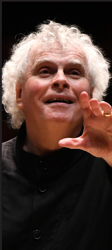
Sir Simon Rattle