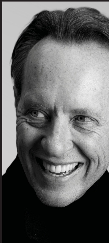
Richard E Grant